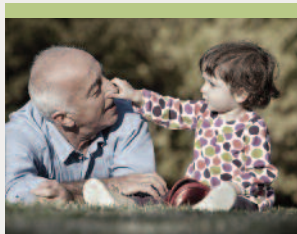
Time to play with family

At Eastgate Manor we recognise the unique needs of people living with Dementia. We support each person's individuality and have designed a Memory Care Suite, which incorporates the latest assistive technology and promotes an active life.