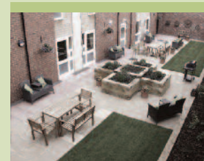
Beautiful garden area