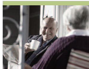
Relax with friends and family