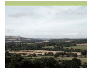
Tyne Valley views*