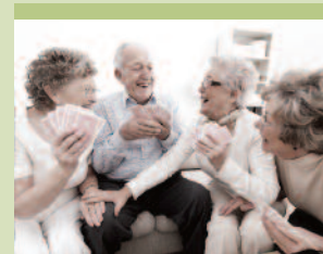
Relax and enjoy

Why not experience Eastgate Manor for yourself and join us for a day visit.